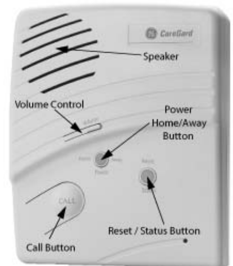
Figure 1. CareGard Panel Front

When the panel cover is closed, the panel buttons are used to operate the system (see Figure 1). When the panel cover is open, the panel buttons are used to set the clock and set medication reminder times.