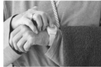
Figure 4. Activating the Personal Help Button

You can activate an alarm by pressing your personal help button. The button may be worn on the wrist, as a pendant, or on a belt.