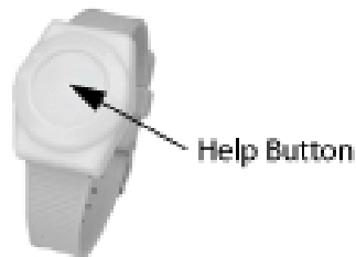
Figure 2. Personal Help Button

The personal help button is used to activate the control panel in case of an emergency (see Figure 2).