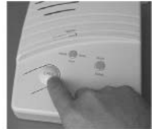
Figure 5. Activating the panel CALL button