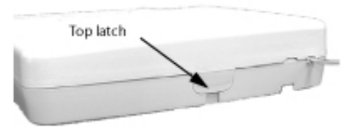
Figure 6. Releasing top latch